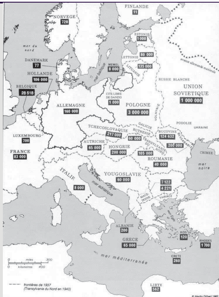
Holocaust victims by country