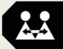
TK Women Restricted (TK WR)