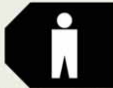
TK Men General (TK MG)