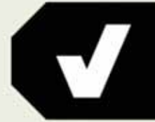
TK Verified (TK V)