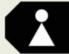
TK Women General (TK WG)