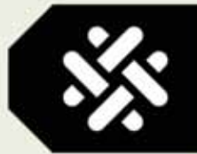
TK Community use Only (TK CO)