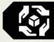
TK Culturally Sensitive (TK CS)