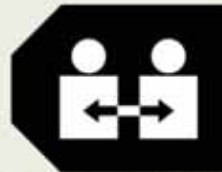
TK Men Restricted (TK MR)