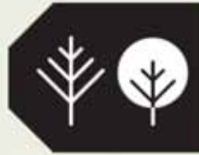
TK Seasonal (TK S)