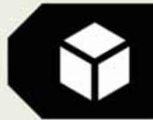
TK Secret / Sacred (TK SS)