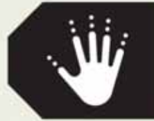
TK Outreach (TK O)