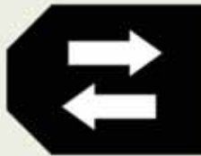
TK Attribution (TK A)