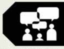
TK Community Voice (TK CV)