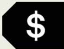
TK Commercial (TK C)