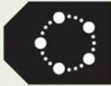
TK Family (TK F)