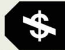
TK Non-Commercial (TK NC)